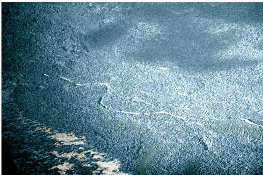
Figure 1. Rheogenic pseudokarst. Oblique aerial photo of partially collapsed lava tube cave, El Malpais National Monument, New Mexico. Compare with Figure 7 showing rectilinear crevice pseudokarst.

a symposium on glacial hydrology were published in Spelunca No. 16.