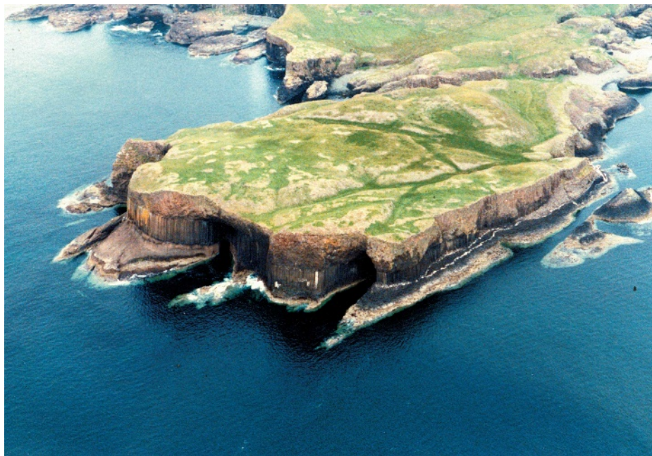
Figure 6. Littoral crevice pseudokarst, island of Staffa, Scotland. The right hand opening is the entrance to Fingal's Cave.

limestone occupied by warm ground water apparently much more than 100 m deep (the National Park Service prohibits cave diving here). It apparently formed as a result of structural tension in the Great Basin and its water is part of a major regional aquifer (Riggs et al., 2000).