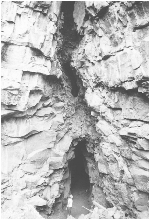
Figure 8. A short segment of the Great Rift, Idaho, seen from a large skylight. The flat is an artificial pathway constructed to permit visitor access.

before a lateral ash-cloud eruption covered its slump with several meters of slightly cohesive volcanic sand. The avalanche layer contained large and small fragments of fractured glacières as well as shattered blocks of bedrock. Some were transported laterally for several kilometers in their original upright position. All was heated, but the degree of hydrothermal injection varied. Almost at once, melting and compaction began to generate crateriform and punched-out depressions varying widely in size.