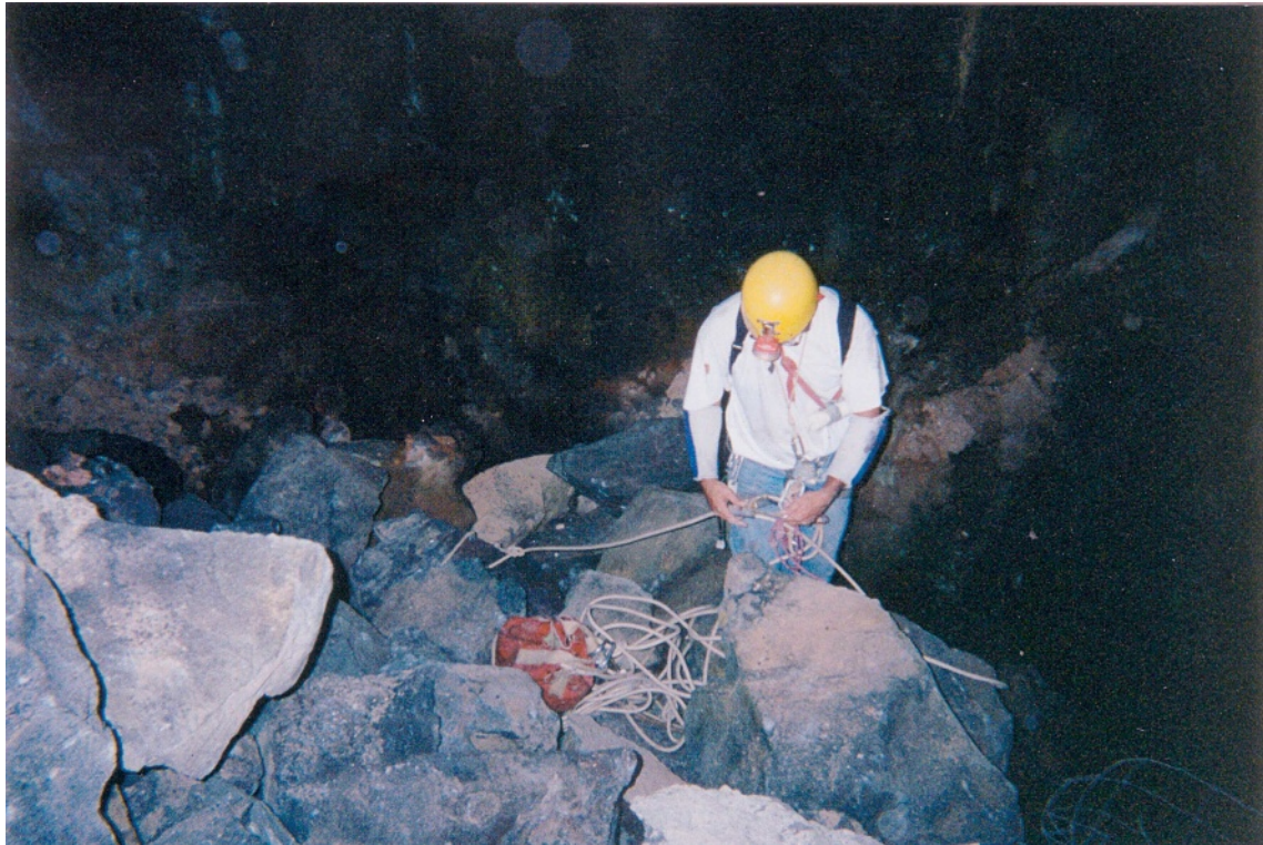
Figure 9. Landing created by wedging of rockfall, the Great Crack, Hawaii. Terrestrial caves of this type are unsuitable for human habitation.