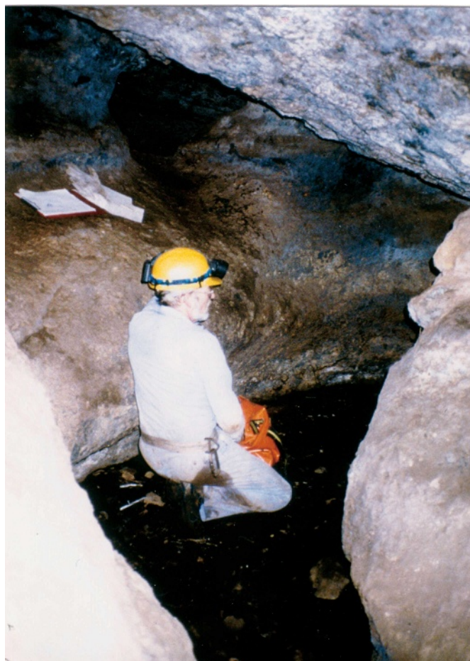
Figure 3. Gigglers Caves, Kenya, a piping cave in hard granular tuff.

Piping is the horizontal, graded or vertical grain-by-grain removal of particles by channelized ground-water flow in a granular material and in some poorly soluble rocks (Fig. 3). Parker and Higgins (1990) and Dunne