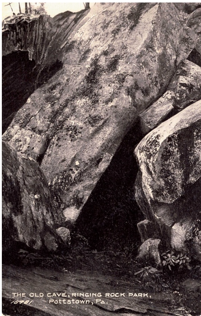
Figure 5. Talus pseudokarst at Pottstown, Pennsylvania. Because the general public is more interested in talus caves than are speleologists, old postcards are a useful resource in identifying them.

The first identification of a terrain as pseudokarst described a crevice pseudokarst in Iceland (von Knebel, 1906). Where karst and karstic caves are readily accessible, however, all but the most spectacular crevice caves and crevice pseudokarst (e.g., Fingal's Cave, Island of Staffa, Scotland) are commonly ignored. Consequently they are much more common than is generally recognized. They occur in both littoral and inland terrains; the former includes littoral zones of now-dry inland Pleisto-