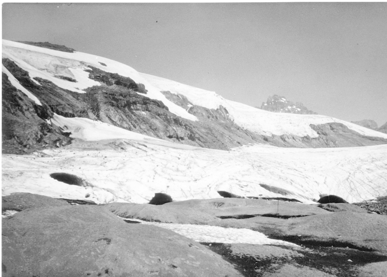
Figure 2. Glacier pseudokarst. Multiple entrances to the Paradise Ice Cave system ca. 1970.

The longest known lava tube cave is Hawaii's Kazumura Cave which has a slope length of 65.6 km. Never more than 20 m below the surface, it has a vertical extent of 1,100 m. Its floor plan basically is sinuous, with local braiding. It is especially notable for drained plunge pools up to ~20 m wide. The deepest known open vertical volcanic conduit is Iceland's Thrinukagigur, 204 m deep. Hawaii's Na One pit crater contains a smaller open vertical volcanic conduit which begins on a ledge near the bottom of the pit crater. Their combined depth is 268 m. Divers have descended 122 m in the water-filled vertical conduit of Hawaii's Kauhako Center, with the bottom beyond reach of their lights.