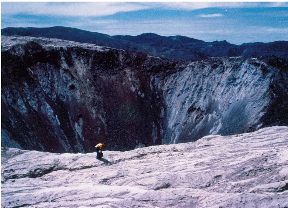
Figure 10. Subsidence pseudokarst. This conical depression in the Spirit Lake pseudokarst (Mount St. Helens, Washington State) was photographed in an early stage of its evolution. A thin ash-cloud tephra deposit is still present on the flats formed on top of the landslide deposit containing the sinkhole.